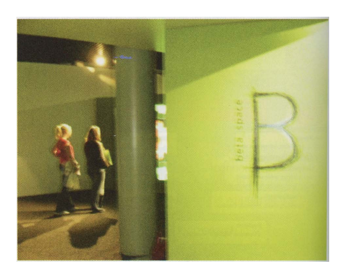
Figure 1: Beta_space in the Powerhouse Museum, Sydney

This paper explores the idea of the exhibition as a public laboratory for interactive art practice and places Beta_space within this context. The paper falls into three sections. It begins by describing the underlying ratio for why interactive art practice must engage audiences, and why this must be done in real-world settings. Section two situates the research aims of Beta_space within the landscape of enquiry into interactivity and audiences. The final section explores the concept of the art exhibition as living laboratory within the broader context of the evolution of cultural institutions and curatorial practices.