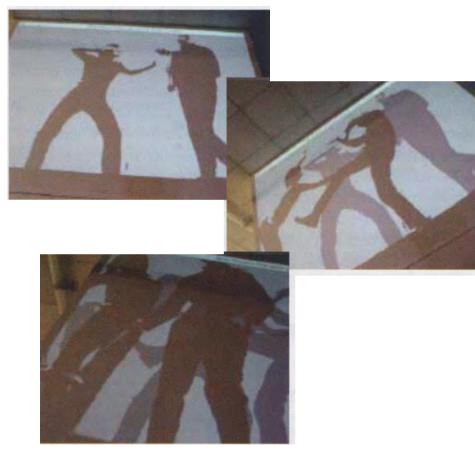
Figure 7 Digital Shadows wallpaper: visual layering of interactions and encounters through time.

When two or more people have an intense discussion, a sensor detects their strong movement and gesticulation, and a camera takes a snapshot. The image of the snapshot is transformed into a grayscale image that reveals the beauty of the movement. However, the faces and identities of the actors remain difficult to discern, so they do not violating the private realm. As one enters the room of shadows, the shadows of recent encounters are superimposed and provide a backdrop to actual activities. The various shades of grey create a living memory of body interactions in space.