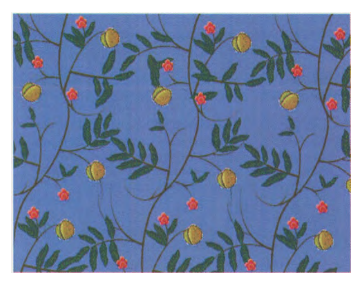
Figure 2 The William Morris wallpaper estranges the room it inhabits, exhibiting an Alice in Wonderland quality. Did it happen or not? Did the flowers become larger? Did the leaves jitter slightly?