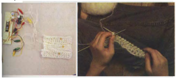
Figure 5 Interactive Fabric made of electro-luminescent wires (elwires) interweaved with angora hair. The fabric lights up when touched and down over time.

The Water Wall. The Water Wall prototype uses falling water as an architectural barrier by forming a thin water curtain and emitting the sound the water makes. Sensor technology allows users to pass the wall in certain instances without getting wet; at other times, users can interact with the water but cannot pass through without getting soaked. The water wall introduces fear, evoking the displeasure of getting wet. The body is involved.