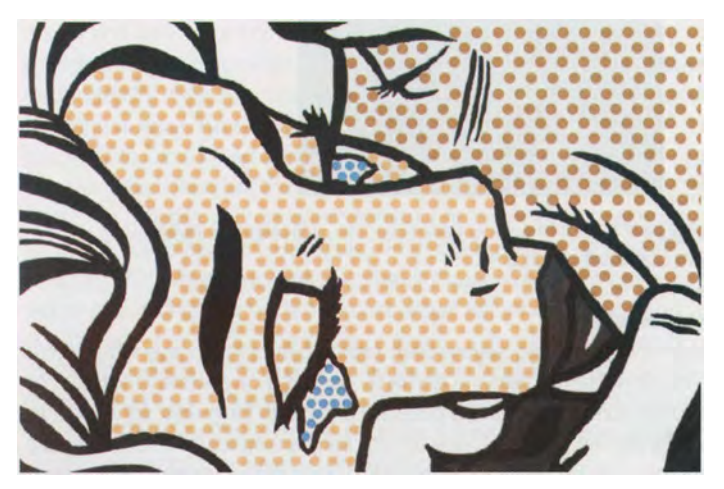
Figure 6 Lichtenstein Wallpaper. Each dot has its own behavior constantly interacting with the contour lines, the viewer, and neighboring dots.

The dots are contained within the contour lines of the drawing and are not allowed to escape: they belong to a specific area (for example, the blue dots belong to the eyes and tears, the orange dots belong to the nose and eyelid, and so forth. As the viewer approaches the wall, the dots become smaller in proportion to the distance of the viewer, creating an interesting optical effect: the size of the dots (the granularity and resolution of the image) feels as though they remain always the same. Finally, when the viewer moves very closely to the wall, the dots start moving away to the corners and along the lines of the drawings, leaving an almost blank contour. The behaviors of the dots give life to the painting and are strongly responsive.